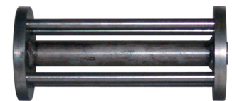
'B' Type Cage