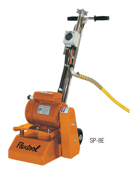
* Petrol SPS units come with a factory installed Cyclopac air filtration system.