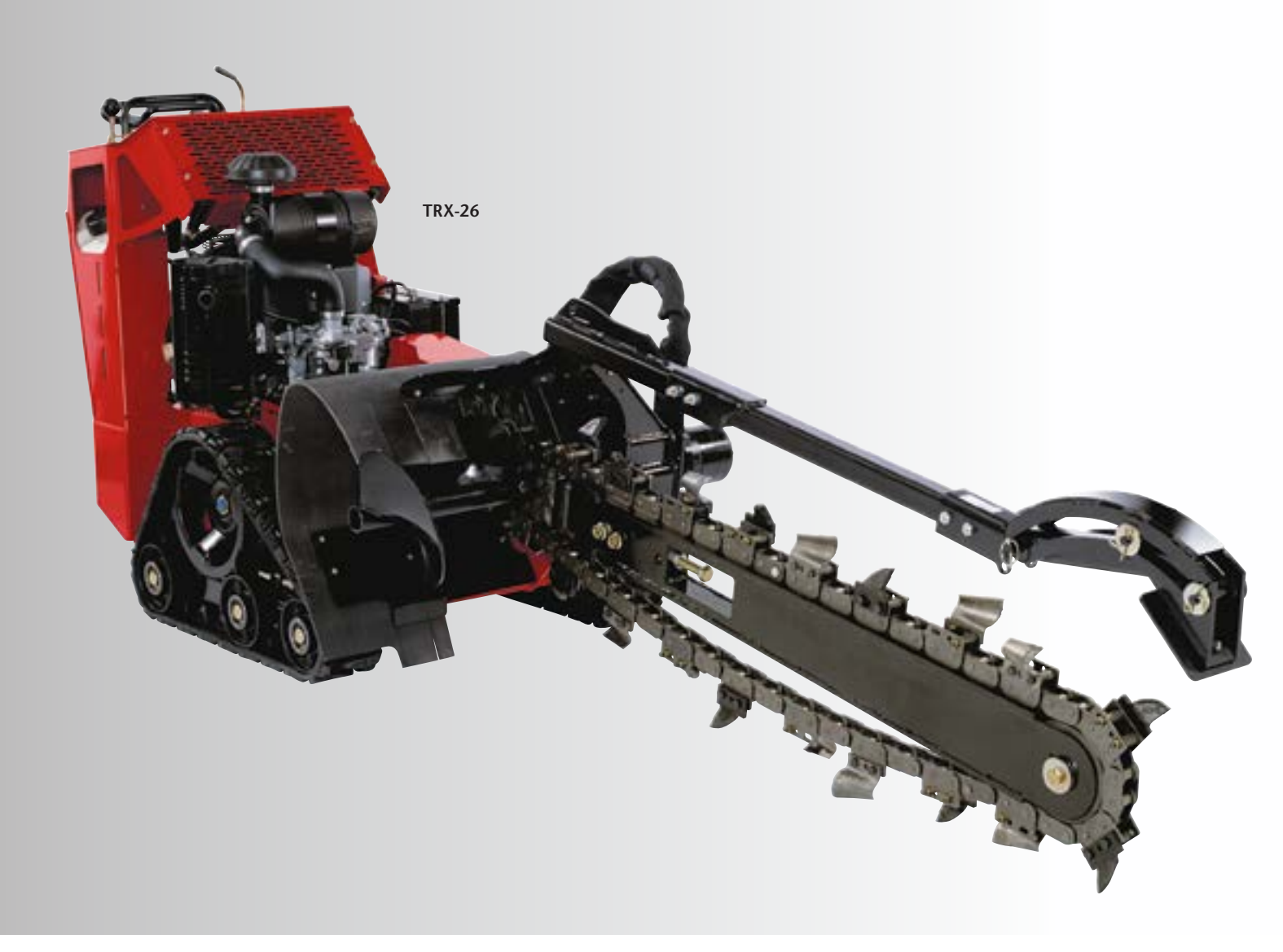
TRX-26 WALK-BEHIND TRENCHER