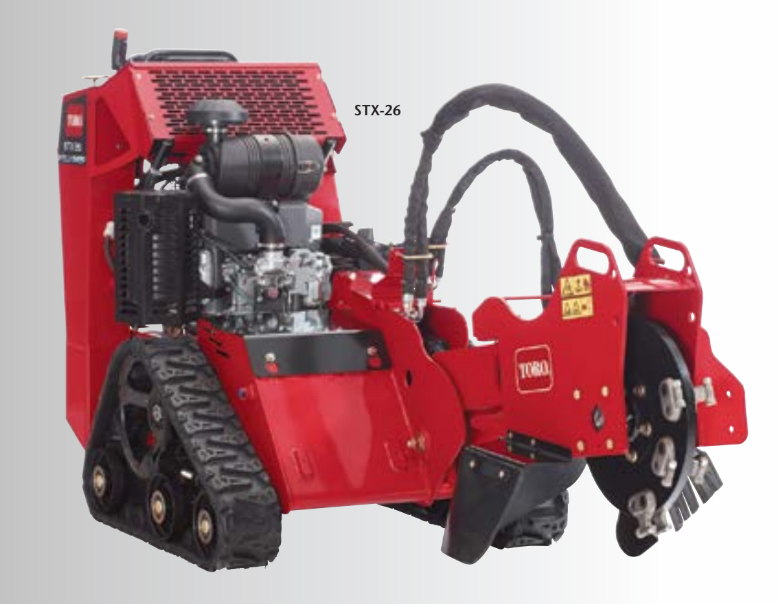
STX-26 STUMP GRINDER