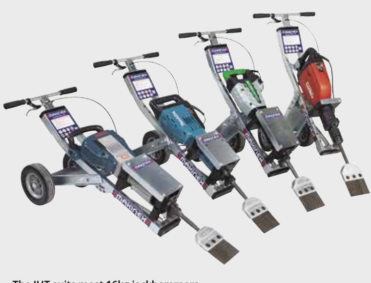
The JHT suits most 16kg jackhammers.