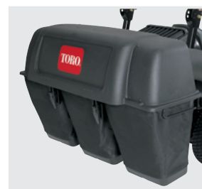
Heavy-Duty Bagging Kit* Blower/Completing Kit

* Heavy-Duty Bagging Kit requires Completion Kit