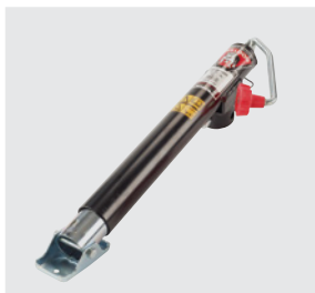
Deck Maintenance Jack