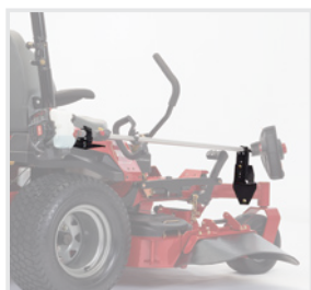
Trimmer Mount Kit