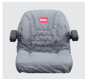
Seat Cover 1500 Series only