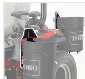
Bucket Holder Kit and Trash Picker Mount