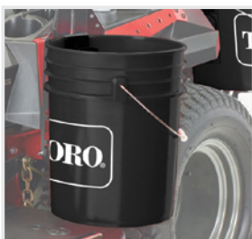
19 Litre Bucket with Toro Logo