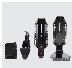
"Triple Threat" Utility Kit Includes Bucket Holder Kit, Universal Mount and Trimmer Mount