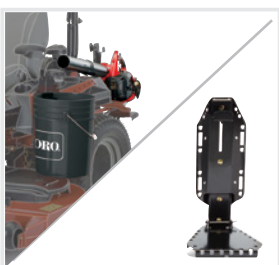
Universal Mount Kit