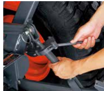
*Optional on B3150SU

Ratchet-type lift rod allows speedy adjustments to 3-point mounted implements. Lift rod adjustments can be made with ease.