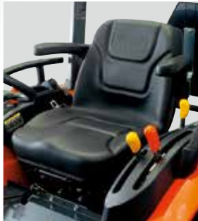
*Not available on B3150SU

The new suspension seat is specifically designed to absorb shock reducing operator fatigue to make your ride comfortable no matter what the conditions. Arm rests are standard equipment for added comfort.