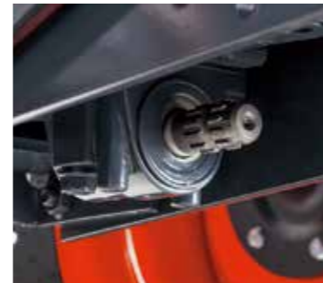
*Not available on B3150SU

The offset PTO allows quick installation and removal of the mid-mount mower.