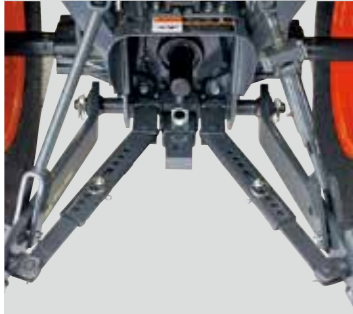
*Not available on B3150SU

Easily adjust the horizontal sway of the implement by aligning and setting the pin in the proper hole.