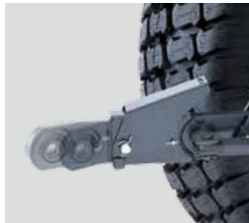
*Optional on B3150SU

Intelligently designed telescopic lowerlink ends make attaching and detaching implements quicker than ever.