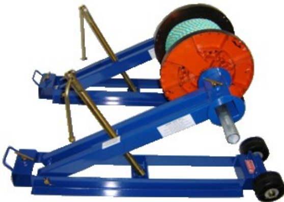
DRUM JACK NO.2