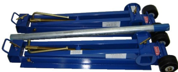
DRUM JACK NO.2 FOLDED DOWN FOR TRANSPORTATION.