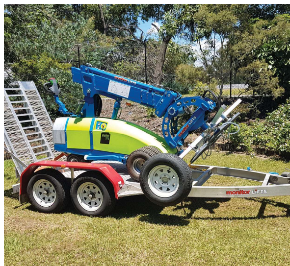
Above: Plant trailer allows easy transportation!