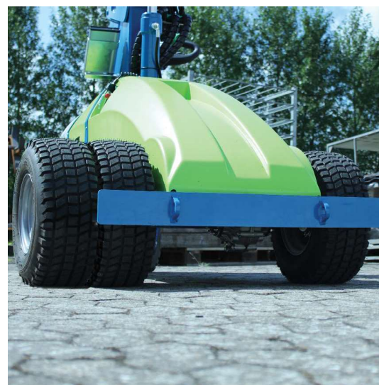
Above: Optional dual wheels and stabilizer legs for enhanced stability.