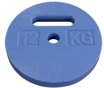
Ballast weight Art. No. 01912