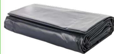
Skip cover Art. No. 01917

No problem with the right GEDA accessories!