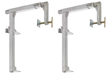
Set of balcony clamps Art. No. 01902