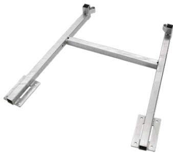
Bolt down flat roof support Art. No. 52104