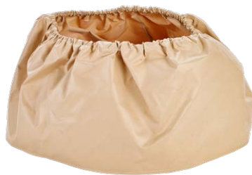
Dust collar Art. No. 01913