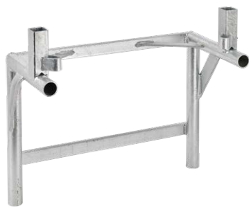
Fixing frame Art. No. 01904