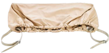
Dust protection hood Art. No. 01909