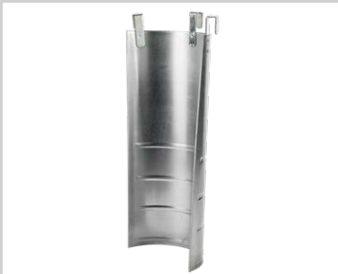
Chute liner Art. No. 01919