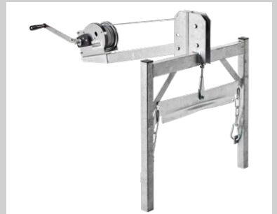
Hand winch (41 m rope) Art. No. 01908