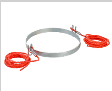
Deflector ring Art. No. 01918

For further accessories visit: www.geda.de