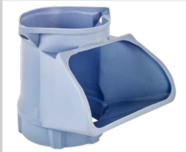
Dump hopper Art. No. 01921