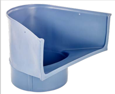
Dump hopper Art. No. 08922