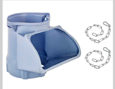
Chute branch section with chains Art. No. 01922