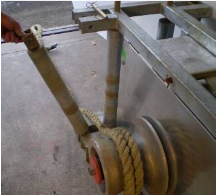
Guide roller open to insert or remove haul rope.