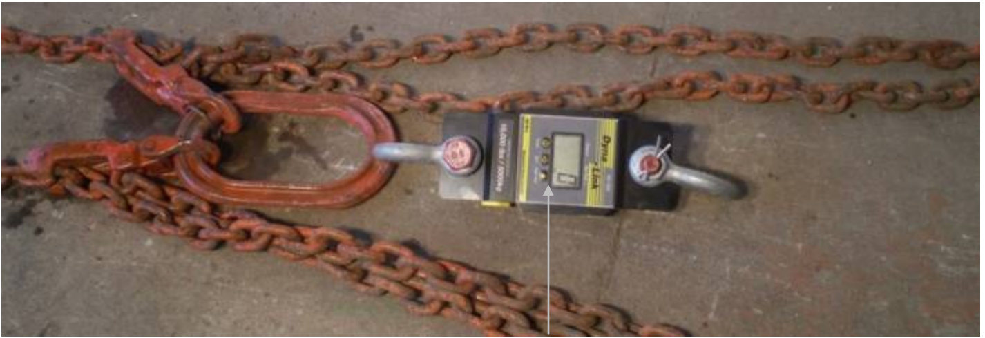
Load cell and shackle (same rating as winch) – Digital Crane Scale\Load Cell with peak load. Fragile handle with care and keep dry.