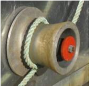
Smaller Capstan High speed

Small Capstan max Pull Slow Large Capstan reduce Pull Fast With 2 capstans and engine a wide range of pulling speeds and tensions can be obtained.