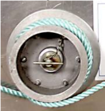
Larger Capstan Low speed