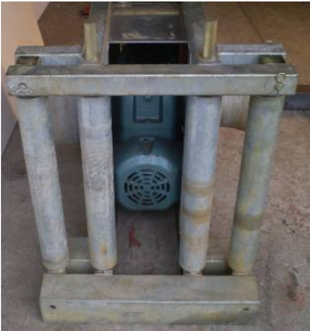
Guide roller closed. Winch should be arranged in such a way that guide rollers are in line with pull as any side loading will twist capstan sideways.